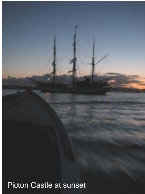
Picton Castle at sunset